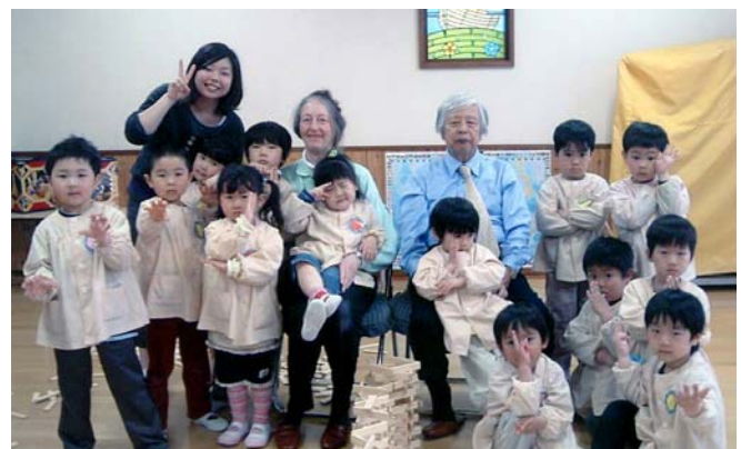
This picture was taken at a rural preschool I visited with the pastor and one of the teachers.

I continue to enjoy working with the preschool children. At a recent program for the parents the children sang "Jesus Loves Me" in English and in Japanese. What a joy to teach the children about God's love at an early age and also witness to their parents through them. Pray that the seeds of the gospel will grow in their hearts.