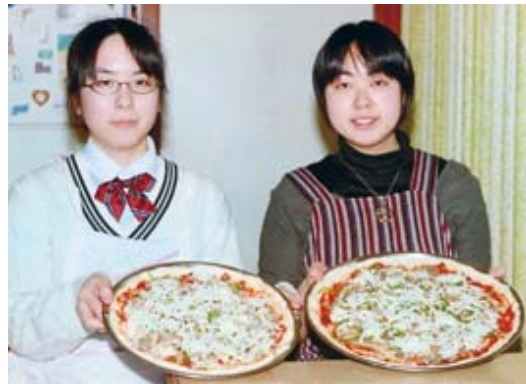
Members of the youth group making pizza

allowed to go on special occasions such as Christmas and Easter. Pray for the Japanese Christians who seek to be faithful here where there are so few Christians.