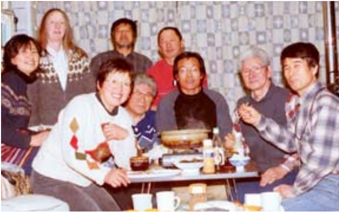
Meeting with a farm group