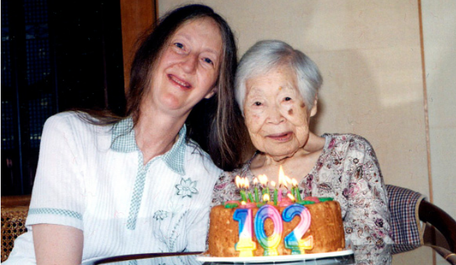
Celebrating 102 years

I had the privilege of traveling to help a special friend celebrate her 102 birthday. This is the 10th birthday I have helped her celebrate.