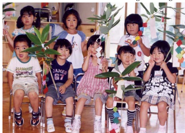
Preschool Summer Program

I'm afraid he doesn't know what it means." "Oh, children are very honest," she replied, "and they look at things differently than we do." I was thankful for the little boy's love and kind words and even more thankful to our Heavenly Father who has given me this opportunity to work with these little ones. Our Heavenly Father too looks at us differently. May we all have thankful, joy filled hearts.