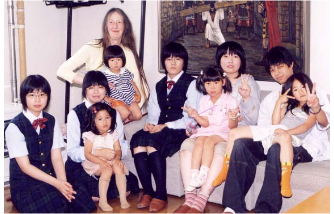
Nopporo youth and Sunday school children

I have continued with the monthly youth gathering at the Nopporo Church. Five churches sponsored a junior and senior high school retreat; this is the first year I have been able to help. I attended the peace service at the Nopporo Preschool with almost all of the 160 preschool children, their parents and their older and younger siblings as well as graduates of the preschool and the members of the after school program. A professional singer gave her time which made the service very special. When the service ended at noon, I went right to the train station to catch a train for the youth retreat. The retreat was held at a rural church and while the youth were writing their evaluations of the retreat, I went to the church preschool. I met the new director and was asked by the teachers to share a Bible story with the children who were there for the summer break program. Having time with the preschool children was an added blessing I had not expected.