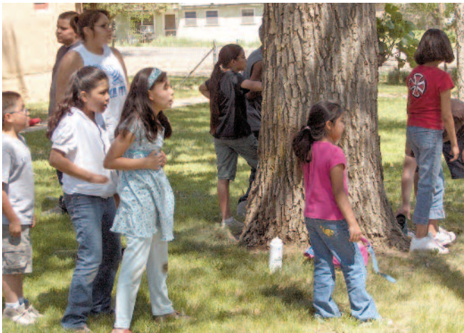
Wisconsin work group playing with some children.

Although we had only one work group this summer—from Gibbsville, Wisconsin—it numbered over forty people, and did they get a lot done: putting a new roof on the gym and over the stage, painting the exterior of the gym and classrooms, shoring up a basement wall of the