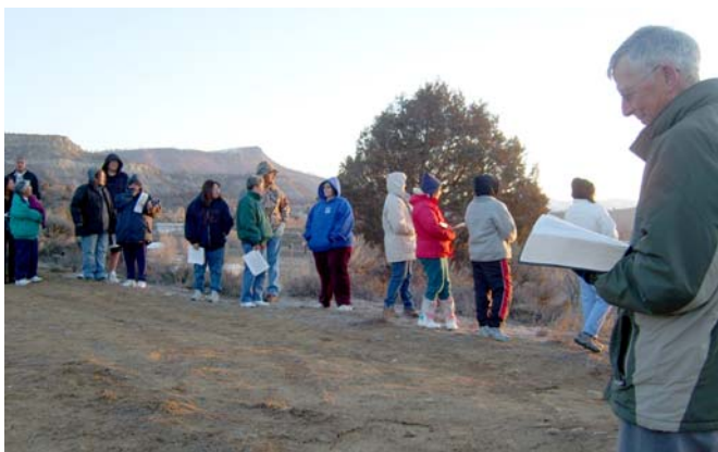
Easter Sunrise Service