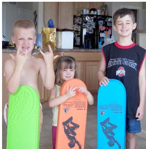
The surf-boarding trio

A day last week was particularly tragic as four young men were drinking and driving south of Dulce when they crashed. Three of them died at the scene, and the fourth was helicoptered to the nearest hospital. The survivor was the driver of the vehicle, and after being released from the hospital, he hung himself. When a member of our church called me to tell me this sad news, she said, "People need to have the Lord in their lives, and too many don't." Please pray that more people here find joy and meaning in the Lord.