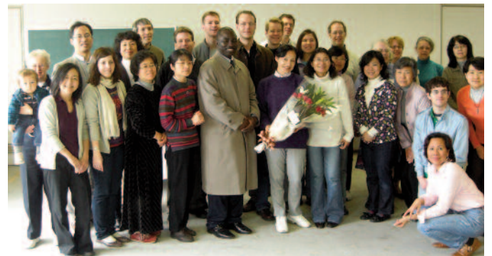
Mission retreat participants