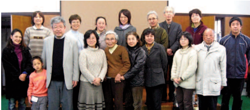
Children and Worship seminar at Fuji Church