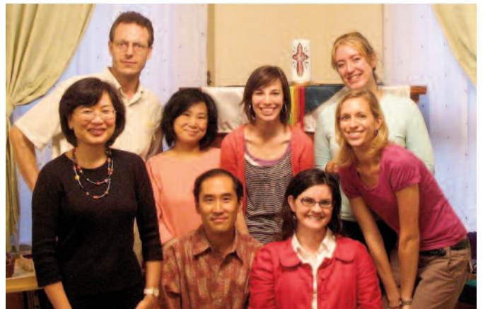
Greenhouse team 2008

I am continuously working with the Children & Worship program, leading the program for Yokohama Union Church on Sundays as well as YUC preschool class each Friday. Reaching out to the preschool mothers though Bible study group is also one of my present callings.