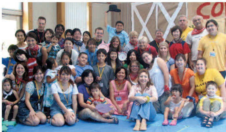
Summer 2008, Yokohama Union Church VBS with team from Grace Reformed in Lansing, Illinois, and YUC volunteers.

Let us tell you about the summer in Yokohama. We had a wonderful Vacation Bible School in August at Yokohama Union Church. Eleven volunteers from the States helped make it possible for the church to serve fifty-six children and their families. We are grateful for Grace Reformed Church in Lansing, IL and Chinese American Church in Sacramento, CA for sending wonderful people to Yokohama. They worked very hard decorating the sanctuary, leading the children in the program even during the extremely hot and humid weather. When the parents found out that the volunteers came from the States sacrificing their own resources and time, with help and support from their churches, they were utterly in awe. They were amazed at the love of Christ moving people in such a way—giving themselves to the little ones in a foreign country! They have never met such people.