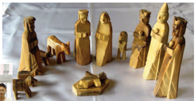
Children & Worship settings at Greenhouse

Please continue to pray and support the youth ministry in Yokohama.