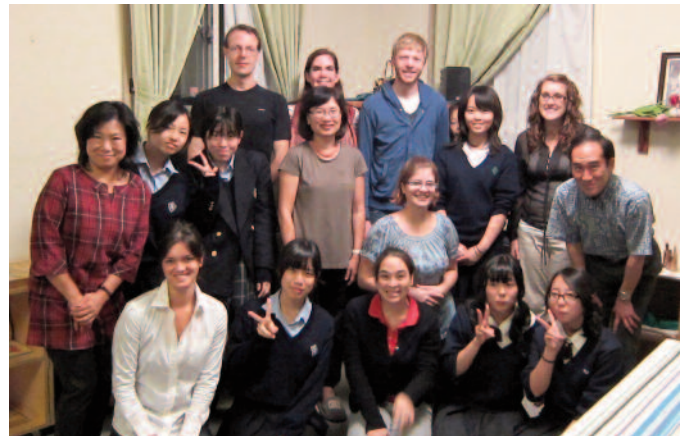
GreenHouse volunteer team and some students