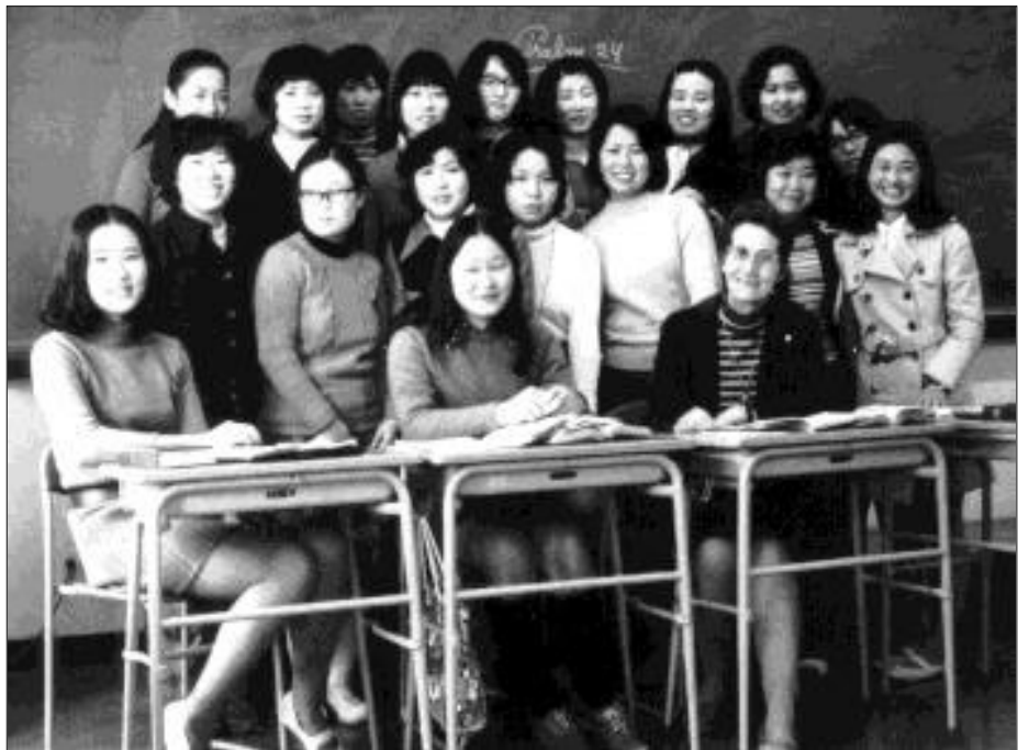
Ferris Seminary was established by the RCA as a school for girls and still provides a first-rate education to the modern Japanese woman.